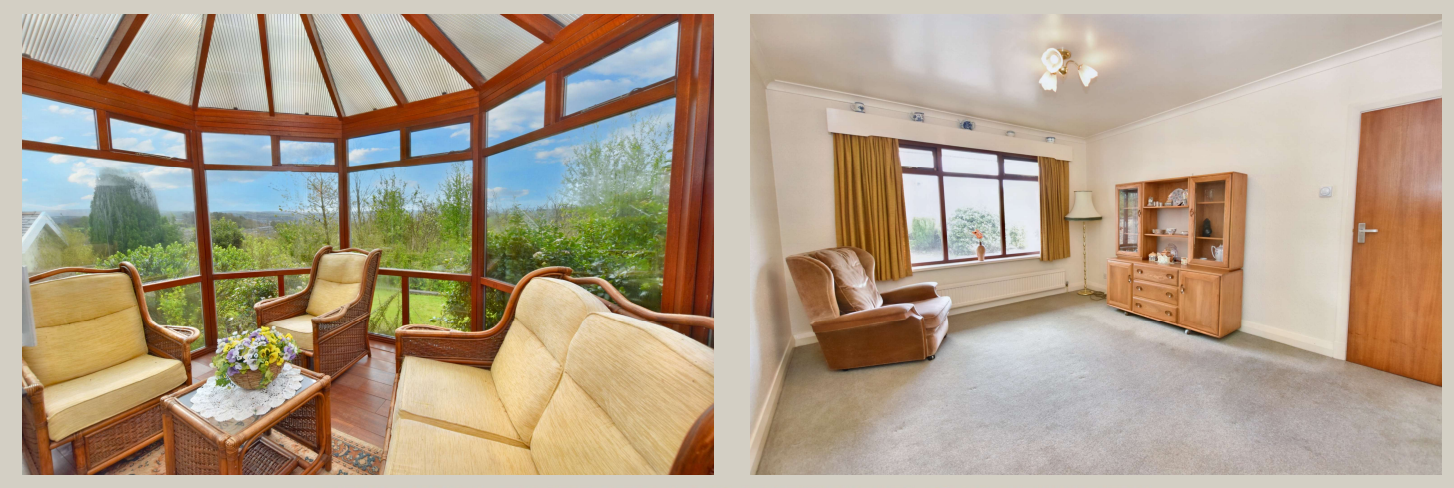
HONEYWELL SELECT, SELLING PROPERTIES OF DISTINCTION

SHOWER ROOM: 3-piece white Roca suite comprising low suite w.c. with push button flush, pedestal wash-hand basin with chrome tap, corner shower enclosure with fitted Mira Zest electric shower, fully tiled walls and linen cupboard.