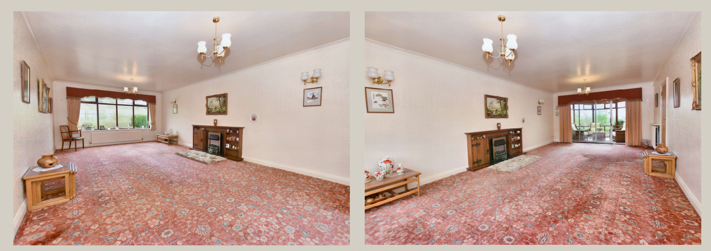
HONEYWELL SELECT, SELLING PROPERTIES OF DISTINCTION

CONSERVATORY: 3.1m x 2.4m (10'3" x 7'10"); a wood-framed double glazed conservatory with wooden flooring and French doors opening to rear garden.