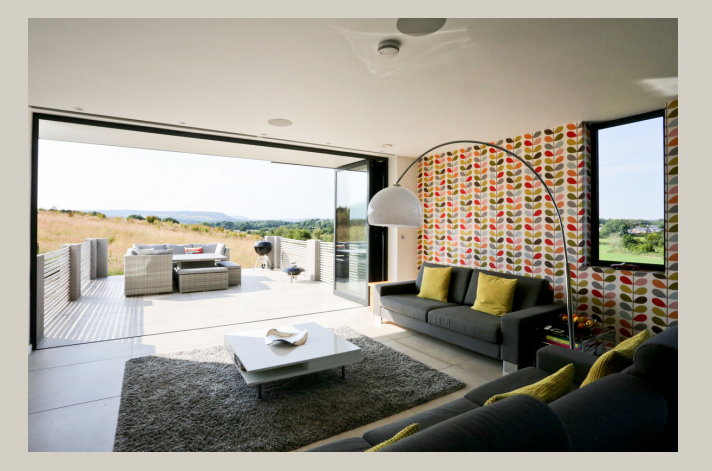
HONEYWELL SELECT, SELLING PROPERTIES OF DISTINCTION