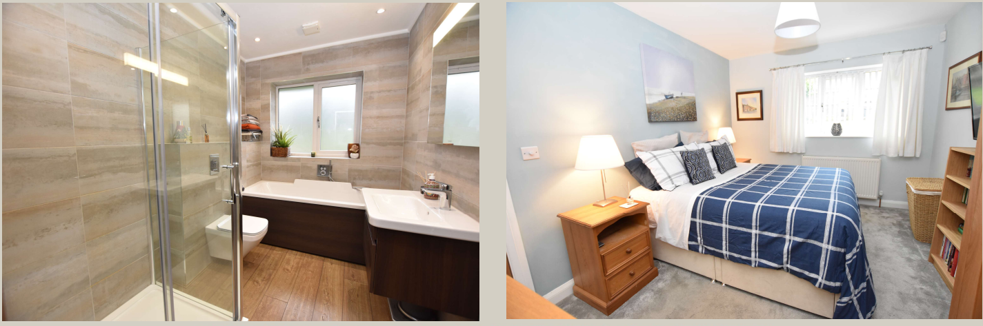
HONEYWELL SELECT, SELLING PROPERTIES OF DISTINCTION