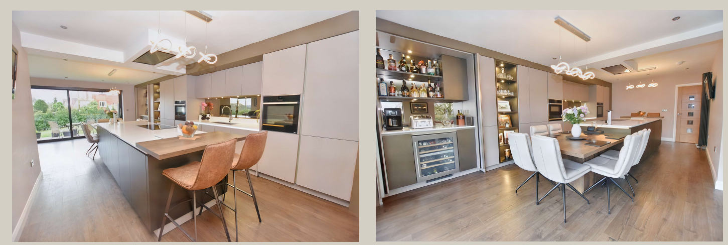
HONEYWELL SELECT, SELLING PROPERTIES OF DISTINCTION

UTILITY ROOM: 1.8m x 2.9m (6'0" x 9'7"); with a fitted range of matt grey wall and base units with complementary laminate work surface with under-unit lighting, stainless steel single drainer sink unit with mixer tap, plumbing for a washing machine, space for a tumble dryer, space for a fridge-freezer, wood effect laminate flooring and half-glazed composite door to rear garden.