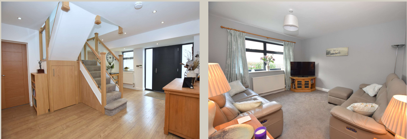
HONEYWELL SELECT, SELLING PROPERTIES OF DISTINCTION

The property benefits from high-speed internet and it is understood fibre optic internet is due for installation in the near future. The property has not only extended the property's footprint but has also provided the opportunity to introduce a significant quantity of extra insulation. Recent gas and electric bills are available to view to demonstrate the impact this has made.