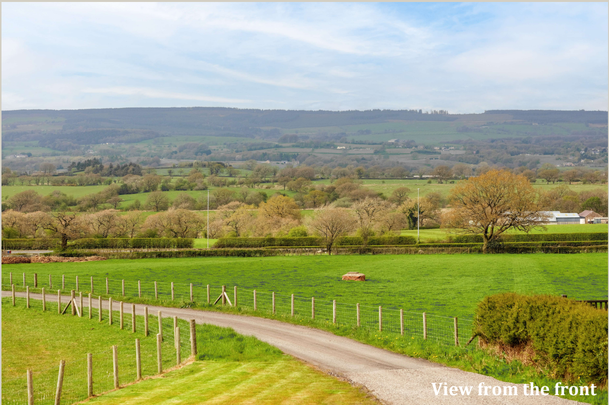
View from the front

Please note: These particulars are produced in good faith, but are intended to be a general guide only and do not constitute any part of an offer or contract. No person in the employment of Honeywell Estate Agents Ltd has any authority to make any representation or warranty whatsoever in relation to the property. Photographs are reproduced for general information and do not imply that any item is included for sale with the property.